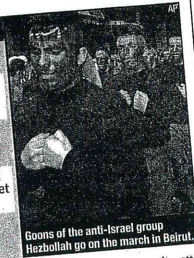
Goons of the anti-Israel group Hezbollah go on the march in Beirut.

known to favor cigarette bootlegging to fund its efforts, particularly in the United States.