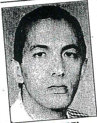
SAIF AL-ADEL New Qaeda commander.