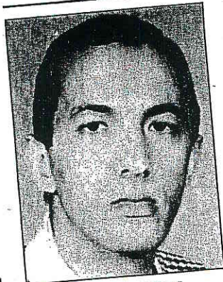
SAIF AL-ADEL New Qaeda commander.