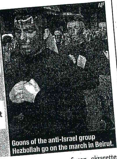
Goons of the anti-Israel group Hezbollah go on the march in Beirut.

ported the butts into New York and sold them to retailers at below market costs. Tax officials estimate the state would have lost nearly $2.5 million in tax revenue.